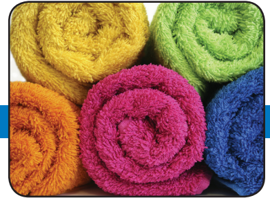
Better in the laundry.