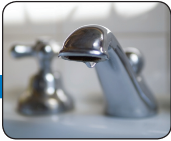
Better in the bathroom.