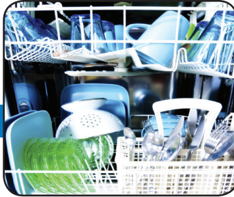
Better in the kitchen.